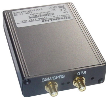
Picture 1 - StreamLine front side

The StreamLine unit can be opened by loosening the two screws located at the front of the unit [picture 1]. Make sure that there are no cables connected to the main unit. The front with circuit board can now be easily removed from the rest of the unit. Locate the SIM area and gently push the SIM card into its place [picture 2]. Close the unit with the screws that were removed earlier. CAUTION: there's only one way to fit the printed circuit board into the housing. Don't use excessive force!