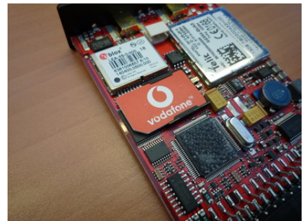
Picture 2 - SIM card location